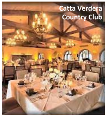
Catta Verdera Country Club

We are seeking support of our corporate sponsors for our 2018 Annual Golf Tournament. Participating firms will receive highly visible recognition for their contributions. Your participation in this winning combination allows us to contribute to and encourage college-bound students to pursue careers in the engineering, environmental, and scientific fields.