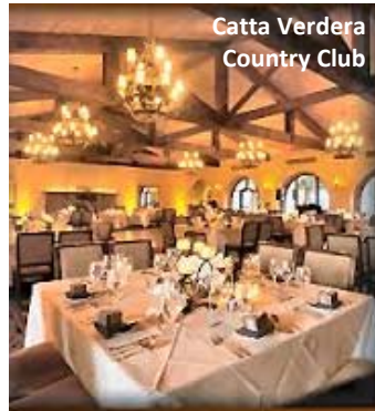
Catta Verdera Country Club

We are seeking support of our corporate sponsors for our 2017 Annual Golf Tournament. Participating firms will receive highly visible recognition for their contributions. Your participation in this winning combination allows us to contribute to and encourage college-bound students to pursue careers in the engineering, environmental, and scientific fields.