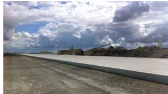
On site batch plant used in the Landing zone and runway construction at Travis AFB