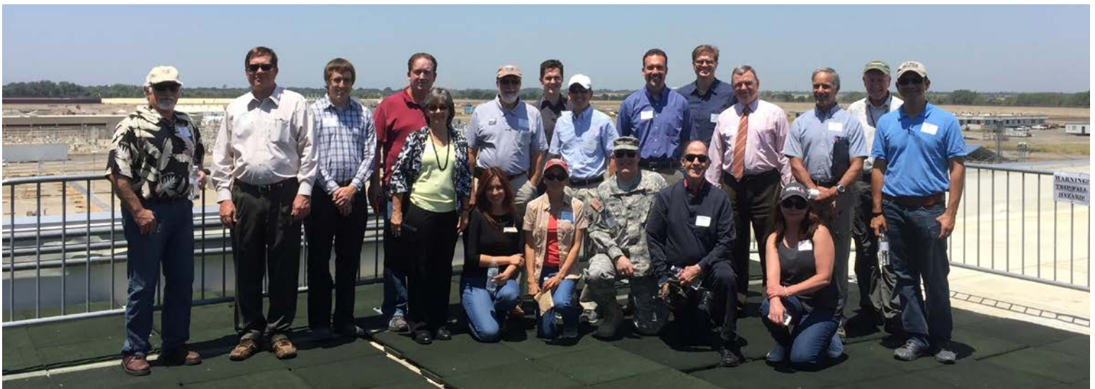
Group photo