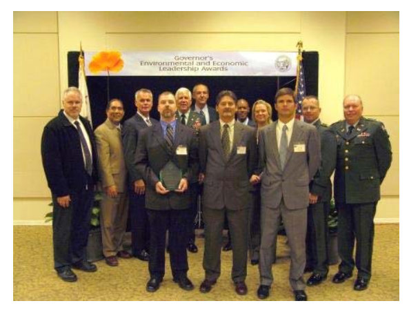
CMD Soldiers and employees, with the Governor's Cabinet Secretaries, receive the GEELA 26 NOV 07