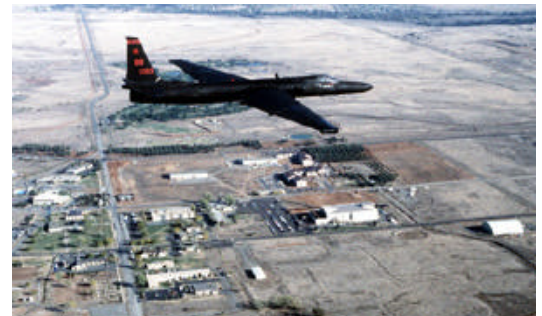
A "Bird's eye" view of the Main Base at Beale Air Force Base. Our view of the base was spectacular from the New Control Tower, not quite this spectacular!

Approximately 55 to 60 persons attended the luncheon at the Recce Point Club on base. In addition, approximately 8 members attended walking tours of the new Water Treatment Plant and Air Traffic Control Tower. Members walked through all 14 floors of the control tower. Members caught a bird's eye view of the base.