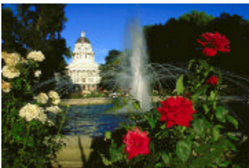
The Sacramento Capitol Building