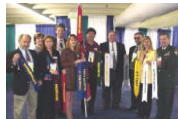
Your Sacramento Post at the Awards Ceremony—2nd Best Post in the World!